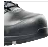
HAIX® Composite Toe Cap