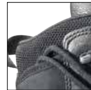
HAIX® Climate System