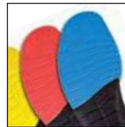
Vario Wide Fit System