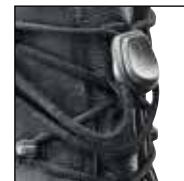
HAIX® Smart Lacing