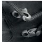
Self closing hooks