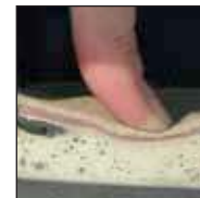
HAIX® MSL System