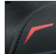
RTC with countersunk seams