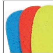
HAIX® Vario Wide Fit System