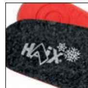
Certified winter insole